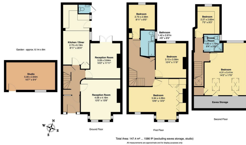
Total Area: 147.4 m 2 ... 1586 ft 2 (excluding eaves storage, studio) All measurements are approximate and for display purposes only